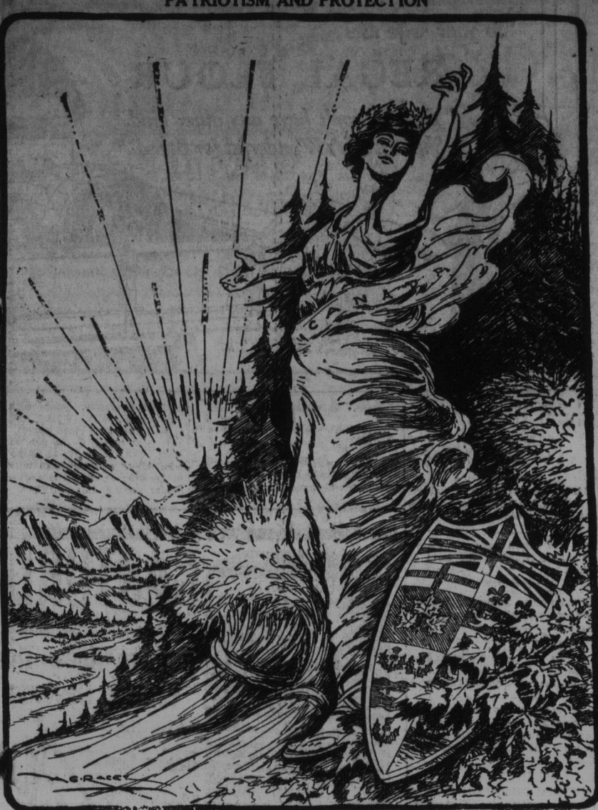
The Spirit of Canada: "Let us sustain the Government that will wisely control the resources of Canada for Canadians."