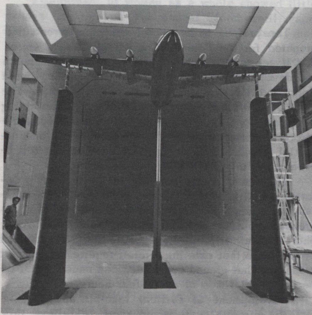
The de Havilland DHC-7 STOL aircraft undergoes tests in NRC'S new huge wind tunnel.

A recently-completed $7-million low-speed wind-tunnel with a 30-foot-square working section, was constructed specifically to be of assistance to industry in the V/STOL fields. The first aircraft company to use this facility on a time-rental basis was de Havilland, with a scale model of its DHC-7. Canadair Limited of Montreal followed immediately after with a propeller component for an experimental four-engine propeller-driven tilt-wing experimental V/STOL aircraft. The wind-tunnel is a major component of the Low Speed Aerodynamics Section of NRC.