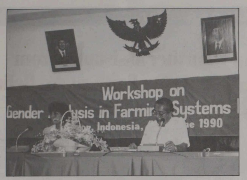
Some of the speakers at the Workshop on Gender Analysis in Farming.