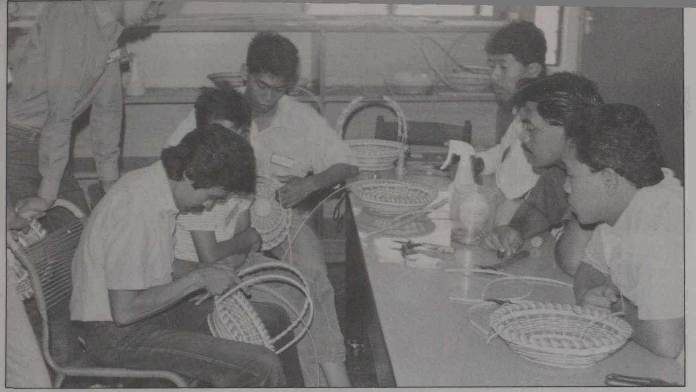
Trainees at the rattan handicraft workshop