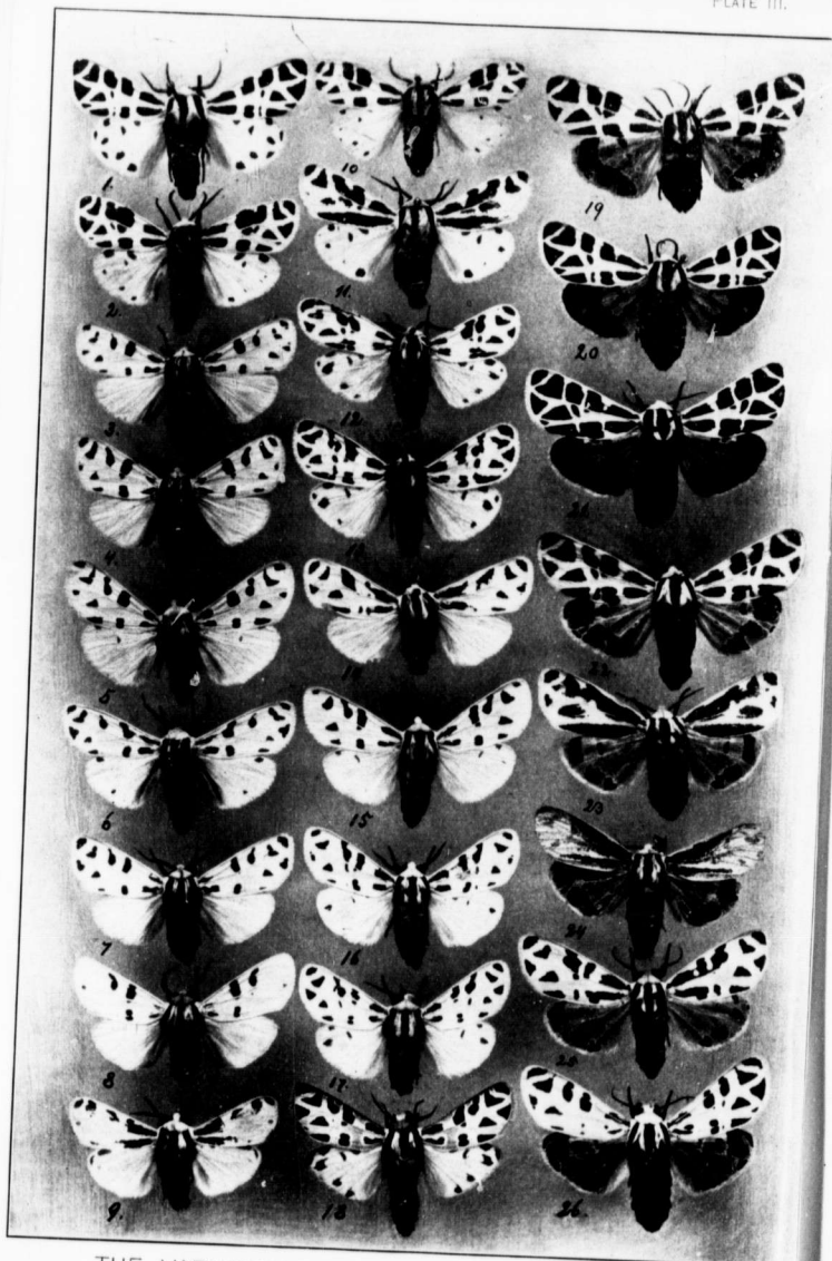
THE VARIATIONS OF ARCTIA PROXIMA , GUERIN.