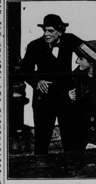
"I Cannot Tell You Anything More.

"Gone out, eh?" the man repeated, speaking in a thick, disagreeable tone "Why, I watched him in here not ter minutes ago. Now then, young lady,