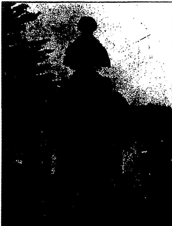
Laura Secord's Monument.