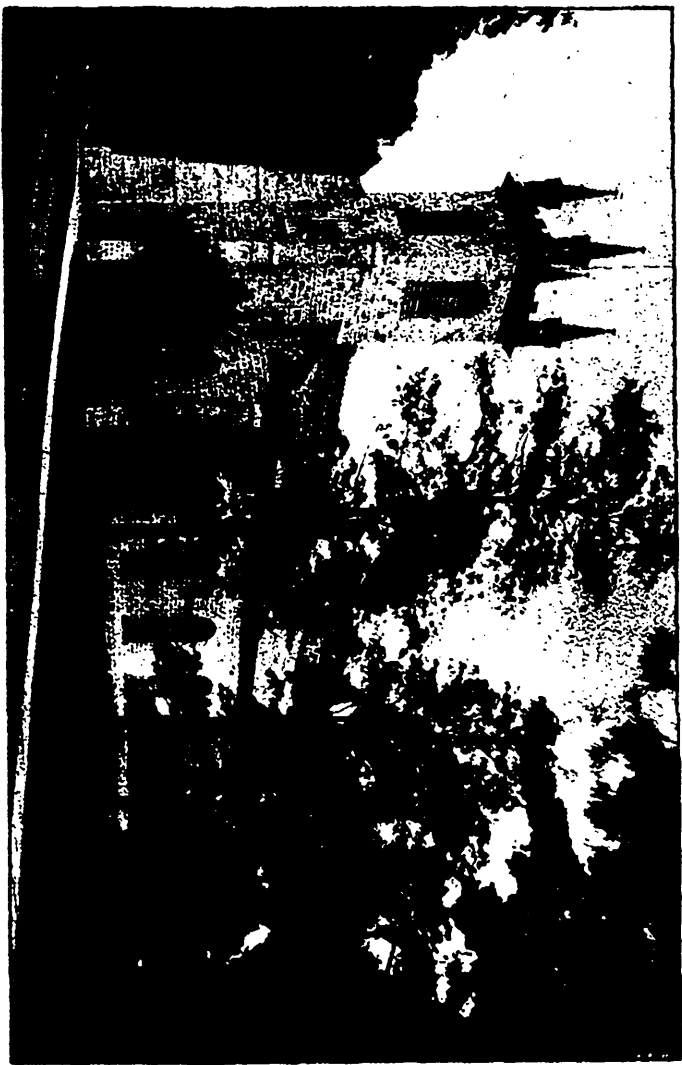
St. Mark's Church, Niagara