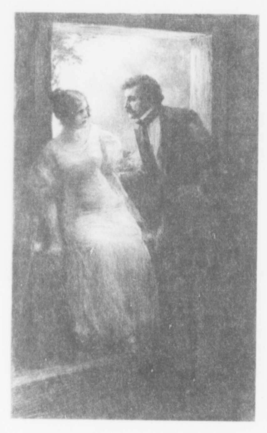
How dore you say that to me?