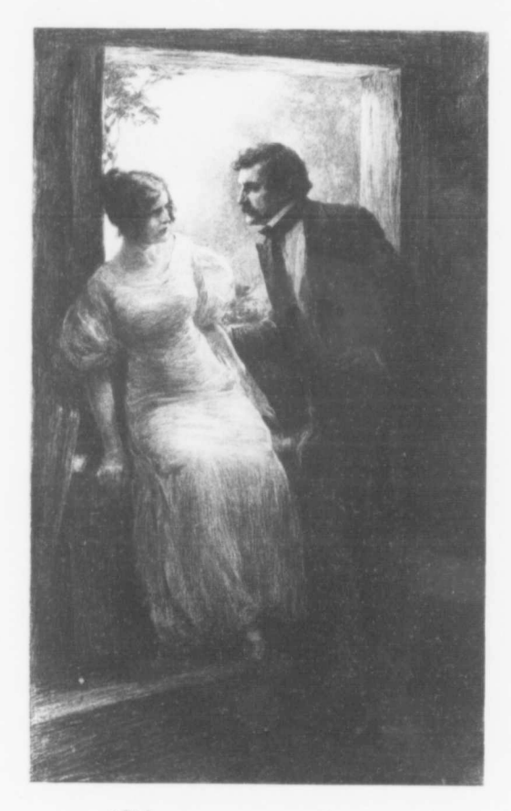
"How dare you say that to me!"