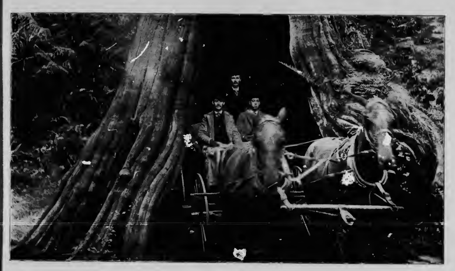
INSIDE A TREE IN STAD OF PARK, VANCOUVER, B. C.