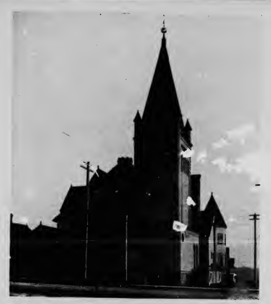
FIRST PRESBYTERIAN CHURCH (THE MOTHER CHURCH OF THE CITY), VANCOUVER, B. C.