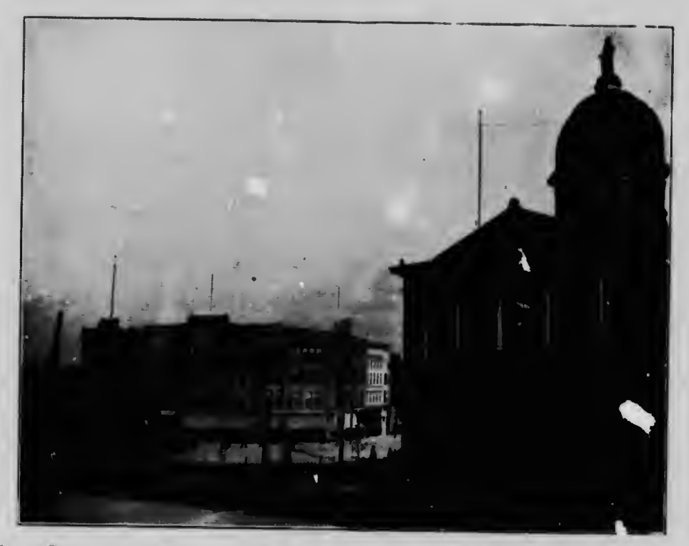
Flack Block and Court House, Hastings Street, Vancouver, B. C.