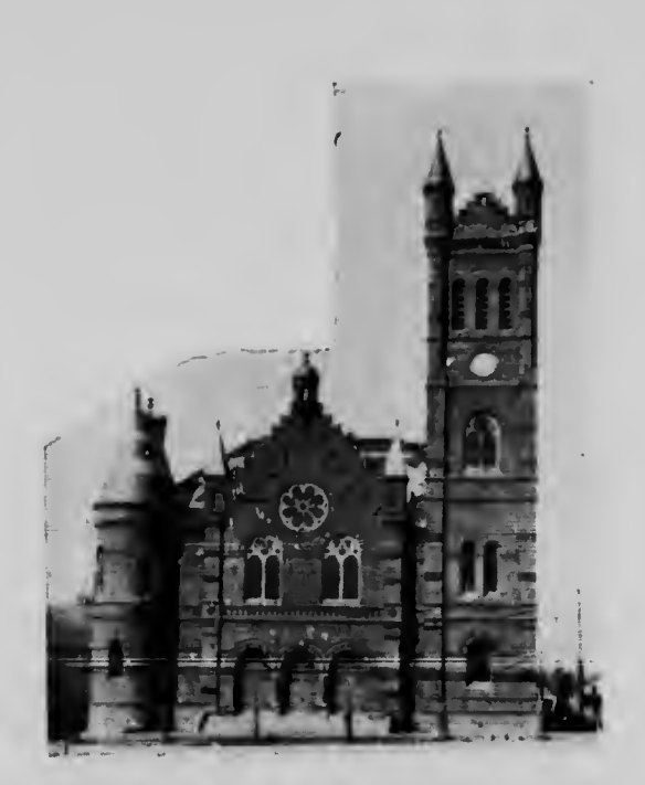
St. Andrew's Presbyterian Church, Victoria, B. C.