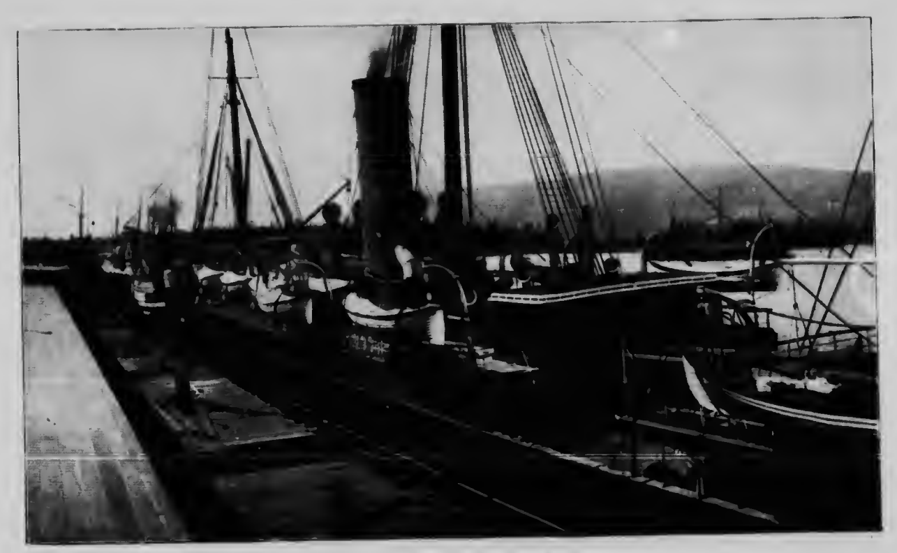
TRANSPACIFIC DOCK, VANCOUVER, B. C.