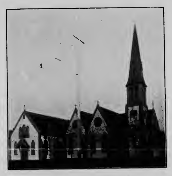
FIRST PRESBYTERIAN CHURCH, VICTORIA, B. C. (THE EARLIEST CHURCH IN THE PROVINCE.)