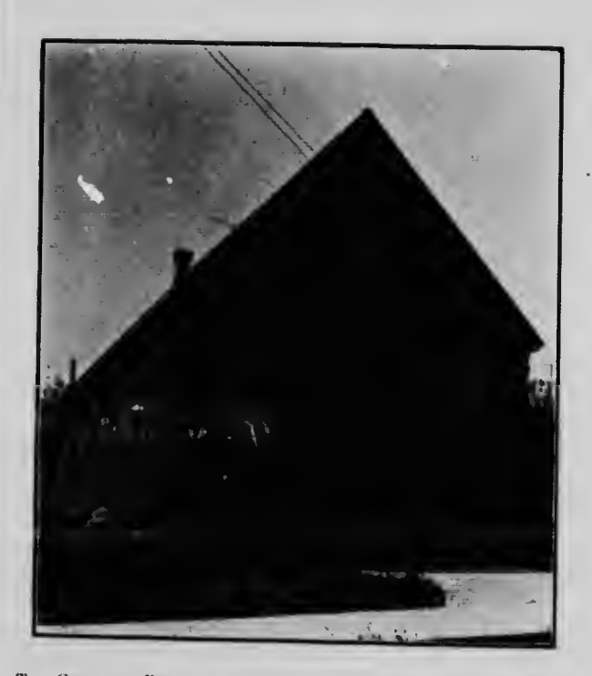
THE CHALMERS PRESBYTERIAN CHURCH, FAIRVIEW, VANCOUVER, B. C.