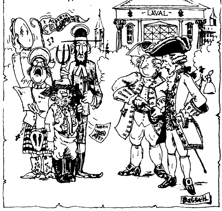
News Item: Laval Rejects Western Canada Week

Dear Consumer, enjoy the fruits South Africa. Rest content in of South Africa. Rest content in the fact that this is the system you encourage when you buy your food from South Africa.