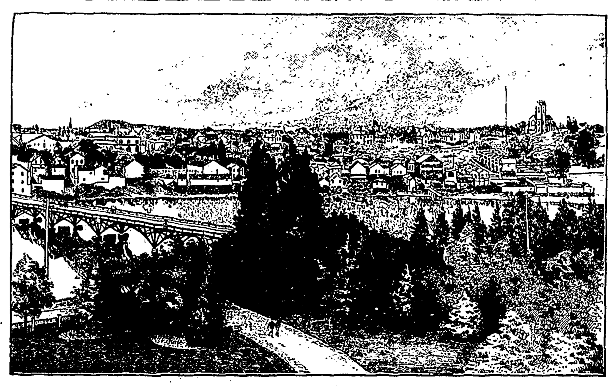
PART OF VICTORIA, BRITISH COLUMBIA.

olent club, than to a place of worship. As we passed along the street we noticed a native jeweller repairing an opium pipe, and we could not help thinking that the nation which gave these people the curse of opium, should, more than any other, give to them the blessing of the Gospel.