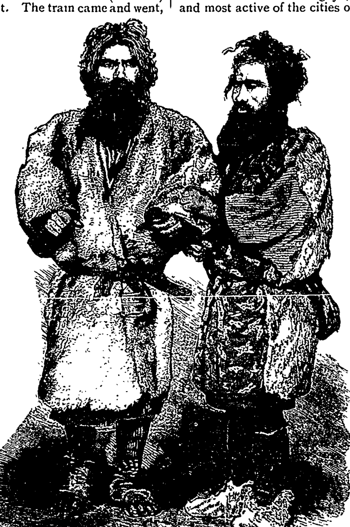
AINUS.-ABORIGINALS OF JAPAN.