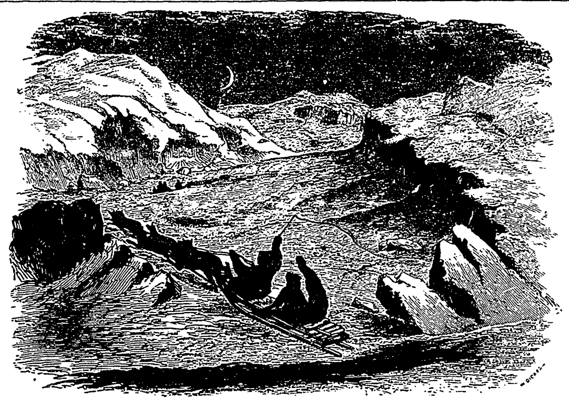
SCENE IN LABRADOR.