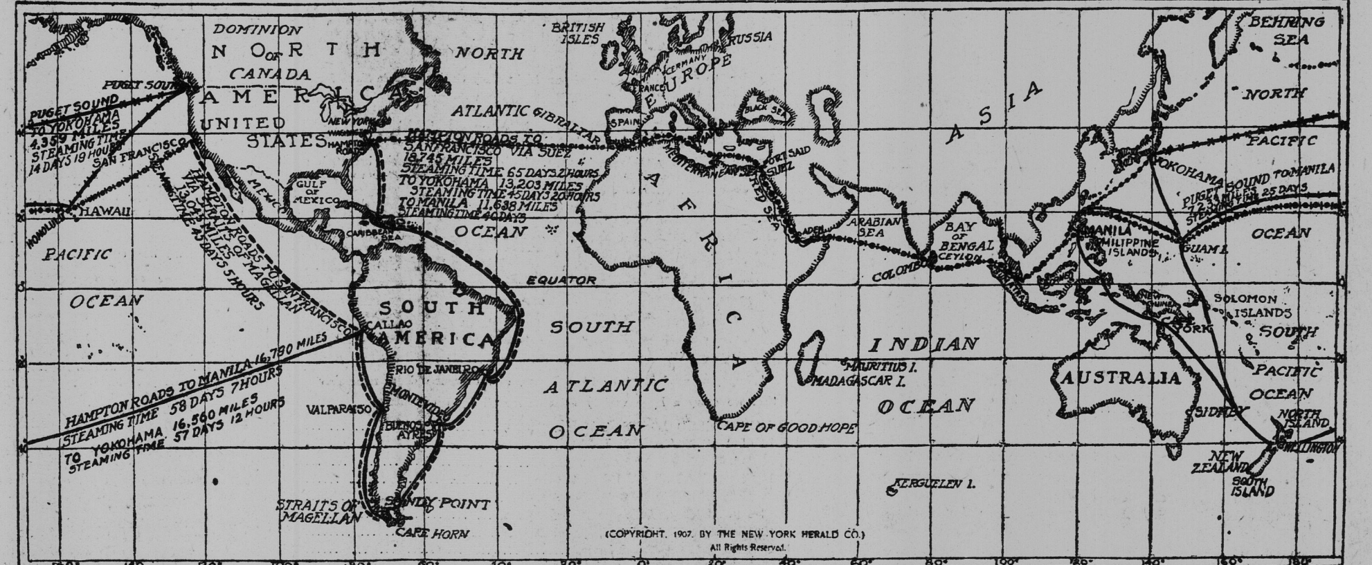
Chart Showing Sea Routes That May be Followed by the U. S. Fleet in I ts Transfer to Pacific or Asiatic Waters.

the sea routes that may be followed by ply, nor has any allowance been made for arated from the exigencies of threaten- by the way of the Straits of Magellan and never be far from the calculations of a