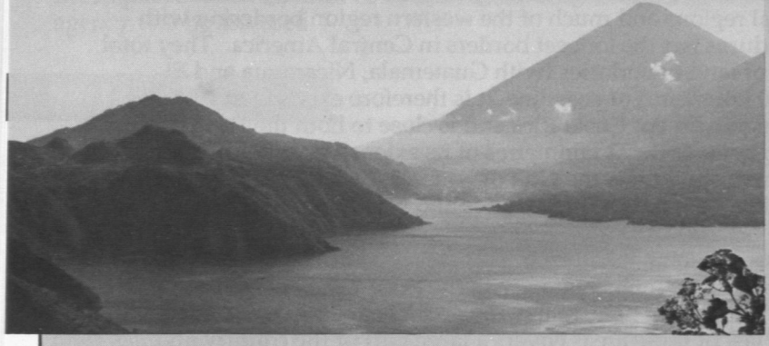
A. Mountains and inland waterways dominate much of Central America

The nature of the terrain in Central America greatly complicates verification activities. The photos here illustrate the contrast between the jungle and mountainous terrain of Central America (A and B) and the relatively open desert environment that faces United Nations peacekeepers in the Middle East (C).