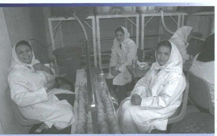
The Canadian-Afghan shampoo joint venture has hired Afghan war widows, most of whom are the sole income earners in their families.

Locally produced products also mean jobs for Afghans. The facility, which produces a brand of shampoo called Florance,