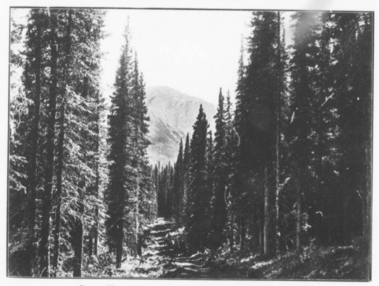
FOLDING MOUNTAINS, FROM TRAIL ON JASPER PARK, CANADIAN ROCKIES.