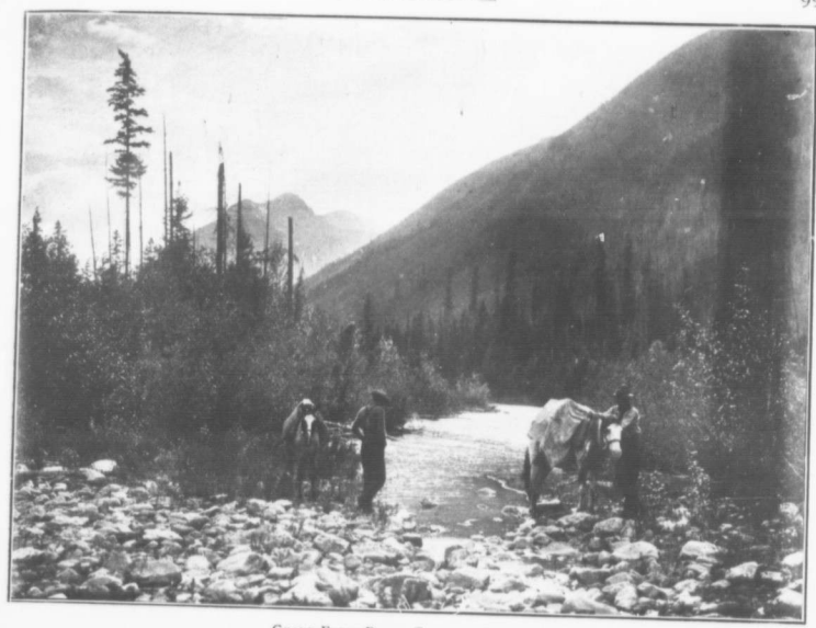
GRAND FORKS RIVER, CANADIAN ROCKIES.