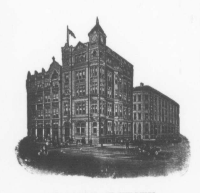
HEAD OFFICE AND BUILDINGS

SUN LIFE ASSURANCE COMPANY OF CANADA. AT HEAD OFFICE. MONTREAL.