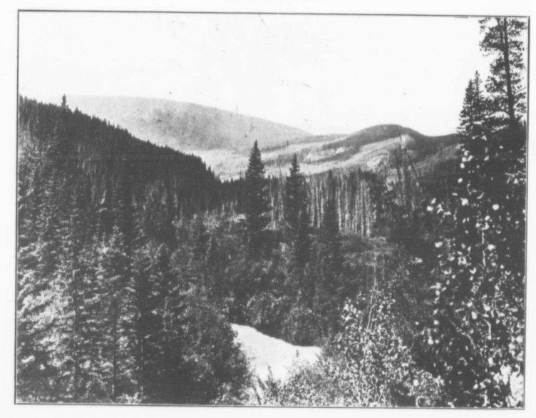
MIETTE RIVER, WOLF CREEK, LOOKING WEST TOWARDS THE YELLOWHEAD PASS, CANADIAN ROCKIES