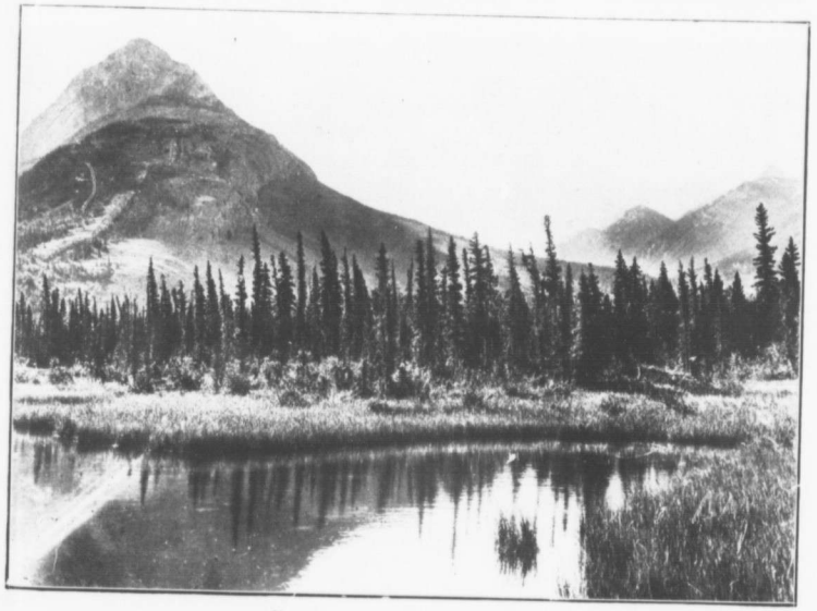
NEAR JASPER LAKE, CANADIAN ROCKIES.