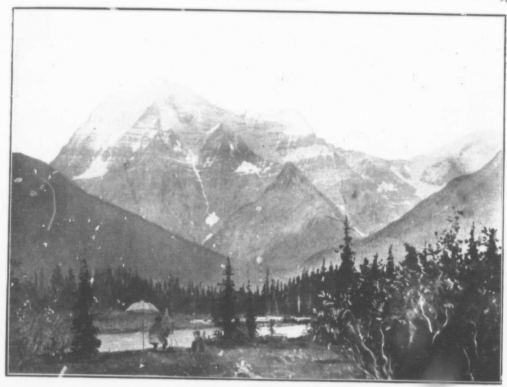
MOUNT ROBSON, CANADIAN ROCKIES.