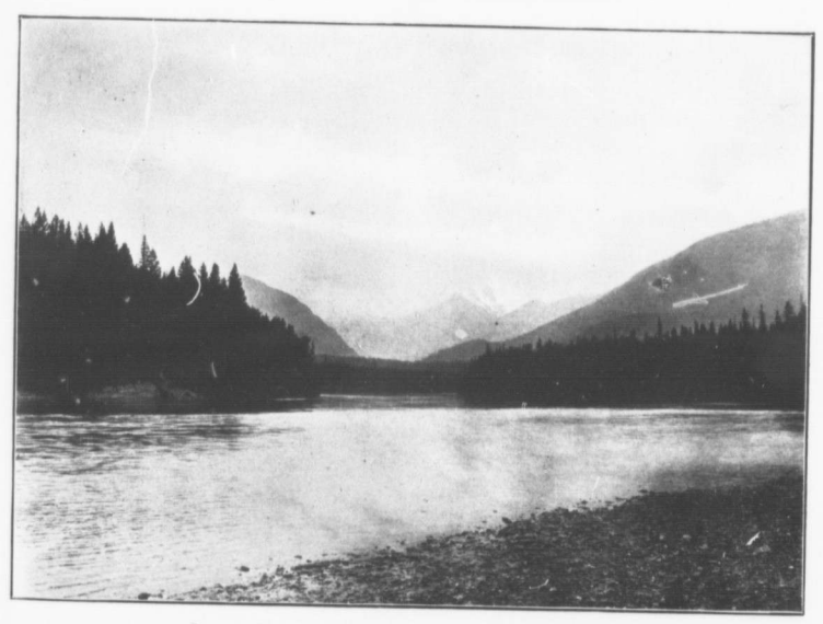
SHUSWEP RANGE, NEAR TETE JAUNE CACHE, CANADIAN ROCKIES.