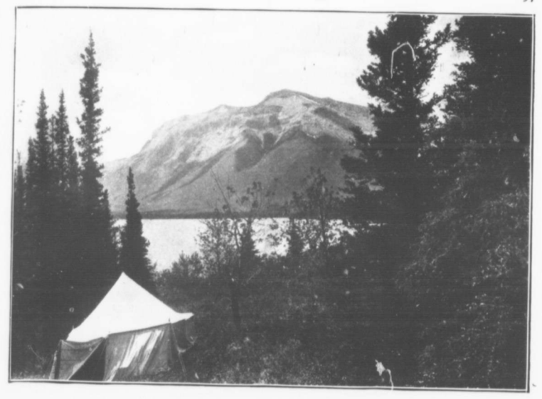
AT THE ENTRANCE TO THE MOUNTAINS, CANADIAN ROCKIES.