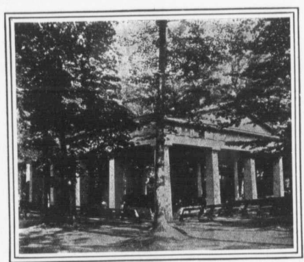
HALL IN THE GROVE, CHAUTAUQUA.

VE. CHAUTAUQUA. a literary club. We all agree that spiritual leaders are needed for the Christian Endeavor and Missionary Departments, but they are equally needed for the Literary and Social Departments as well. You cannot take a single drop of water from the ocean that is not permeated with its salt, and there should be no hour or moment of life, no deep wave of sorrow or ripple of mirth which the salt of a Christlike aim and motive does not permeate. Let us seek more earnestly than ever before to write over the portal of every department, "Holiness to the Lord"; and when we elect