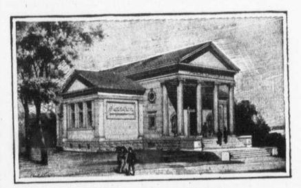
HALL OF CHRIST, AT CHAUTAUQUA.