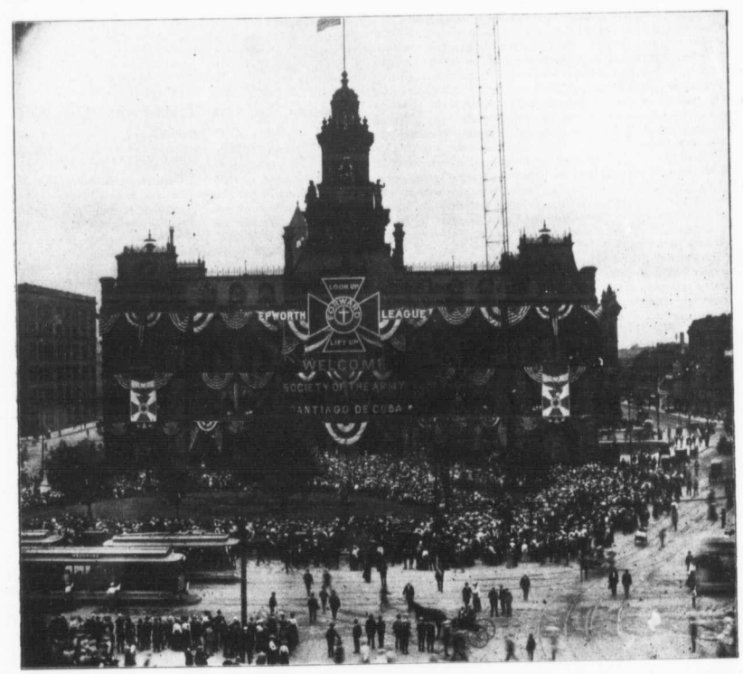
EPWORTH LEAGUE MASS MEETING AT DETROIT.

As we sit we lift our eyes to the broad expanse and see a