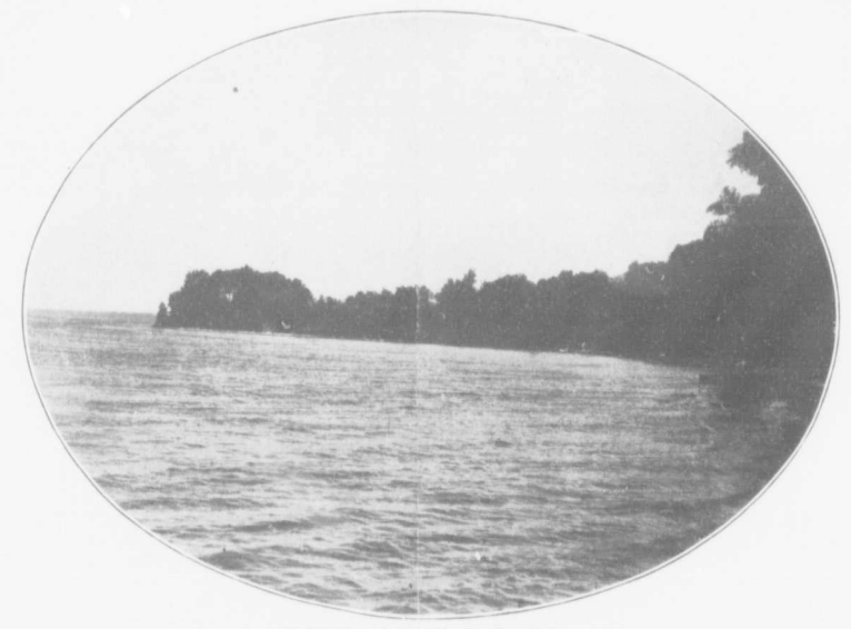
PENINSULAR PARK-Big Bay Point.