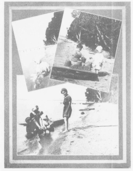
PLAYING ALONG THE SHORE IN SAFETY.

madding crowds ignoble strife." Separate and well equipped nurseries are furnished for those having children, so that the worry of having to provide amusement for the little ones has been forestalled. The hotel has accommodation for 100 guests and the table set is all that the most fastidious could ask for.