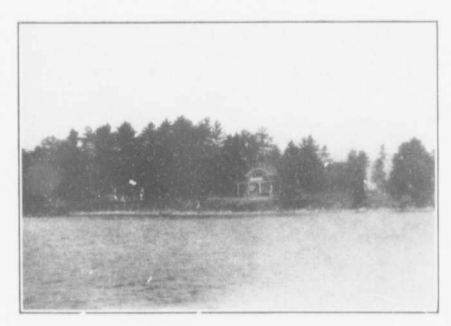
COTTAGE ON THE WATER FRONT

close association with this enterprise have organized and brought into being "The Lake Simcce Navigation Co.," which company has purchased the palace steamer "Otonabee" and put it into service on the lake giving connection between Peninsular Park and Barrie (where it meets all regular Grand Trunk trains) and in addition furnishing connection with Jackson's Point, Roche's Point, Belle Ewart and other places to which points a regular service is maintained with Toronto, by both electric and Grand Trunk railway lines.