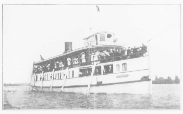
SS. OTONABEE—Approaching Peninsular Park.

The steamer "Otonabee" is a staunchly built craft, having a licensed carrying capacity of 450 people and is fitted with twin screws, is electric lighted and is thoroughly equipped with everything requisite to make an up-to-date passenger service boat. The mind cannot picture anything more exquisitely beautiful than to