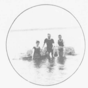
A SUN BATH.