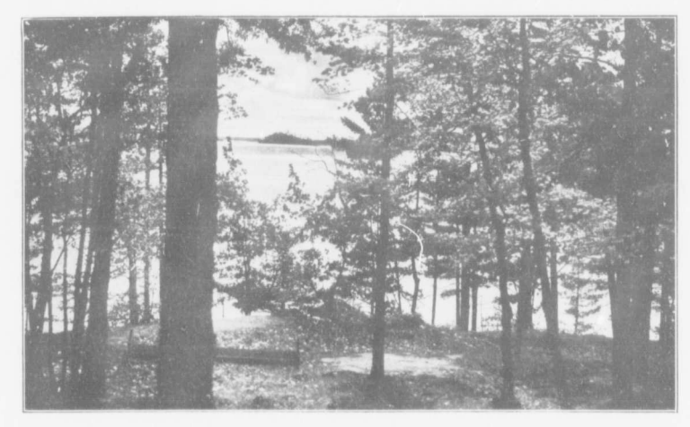
OVERLOOKING KEMPENFELDT BAY.