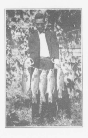
A GOOD CATCH.

To those delighting in fishing, the lake and bay afford excellent sport. Black bass, pickerel, perch, white fish and salmon trout are numerous and within easy reach of the park property.