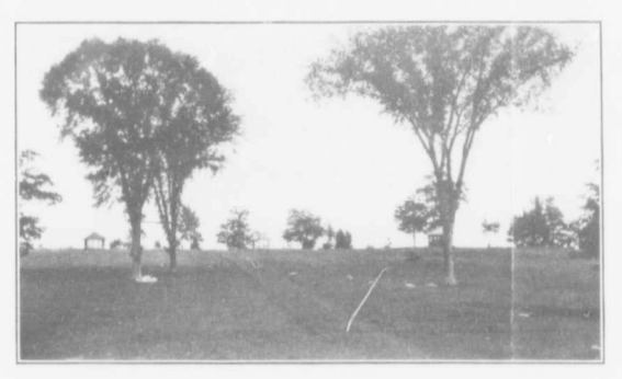
GOLF COURSE-PENINSULAR PARK

different points of the compass and stretches about 30 miles from North to South and the same distance from East to West.