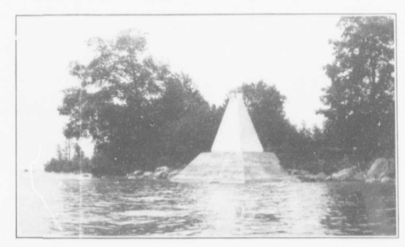
LIGHT HOUSE - Big Bay Point.

Peninsular Park is largely covered with fine old patriarchal trees saved from the virgin forest. Sturdy old oaks, branching walnuts, graceful elms