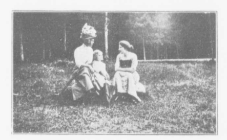
WAITING FOR THE LAUNCH.

To the lovers of nature there is everything to please, not the least being the large number of black squirrels with their saucy impertinent chattering as they bound from branch to branch.