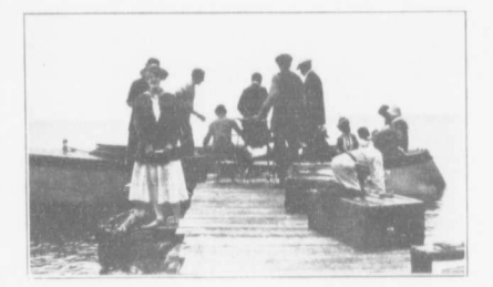
LAUNCH KEMPENFELDT—Available for Side Trips.