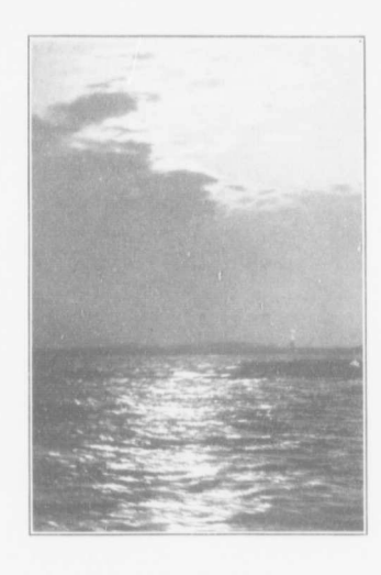
MOONLIGHT ON THE BAY.

Numerous excursions are run by the steamer "Otonabee" to the several points of interest on the lake and to accommodate those wishing to form a boating party to some particular spot for the day, the commodious launch "Kempenfeldt" is available at a very moderate charge.