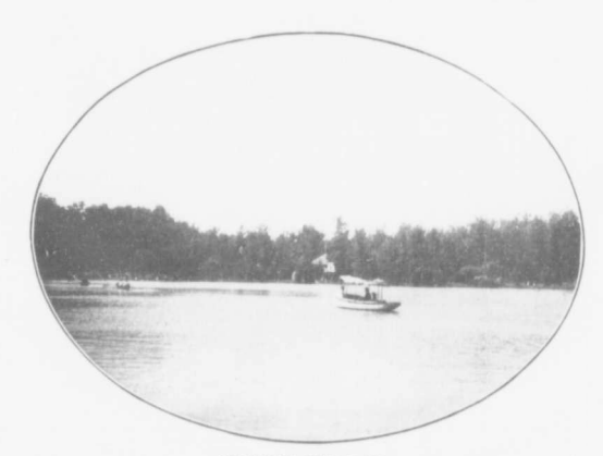
CROSSING THE BAY.