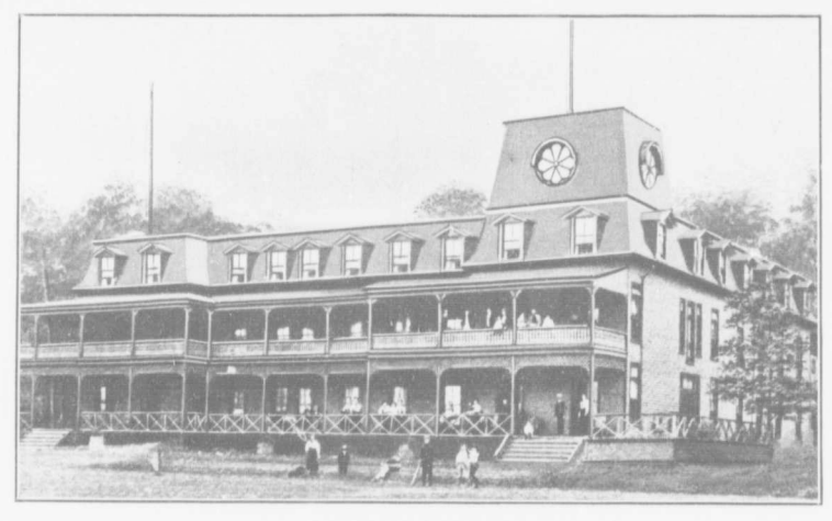
PENINSULAR PARK HOTEL

and waving pines with their resinous odor pervading, greet the eye all over the place and one can hardly conceive the charm of restfulness that permeates the whole atmosphere.