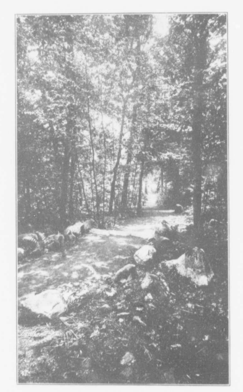
LOVER'S WALK-PENINSULAR PARK.