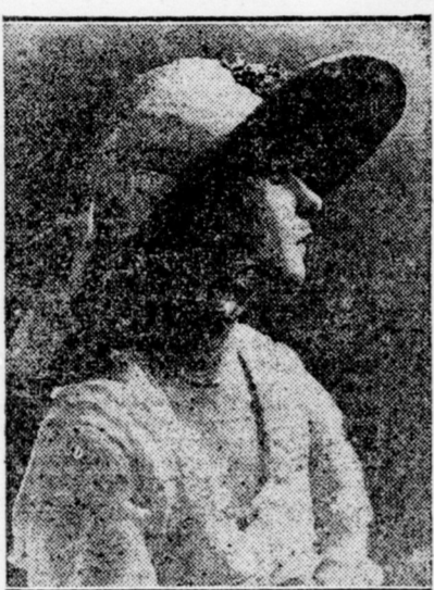
MRS. CHARLIE CHAPLIN, appearing at the Majestic today and Tuesday, in "Four Husbands Only." Also a Pathe comedy, a British News Weekly, a Burton Holmes travelogue and the Buckeye Jazz Band in vaudeville.