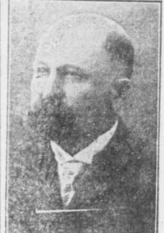
HON. W. R. MOTHERWELL