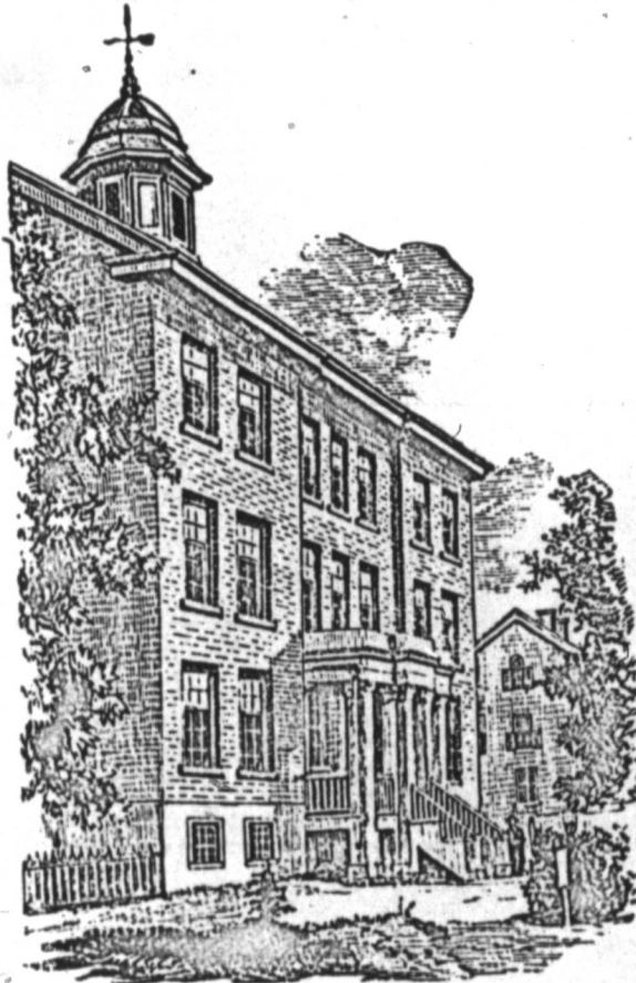
BOYS' SCHOOL, POINTE-AUX-TREMBLES.