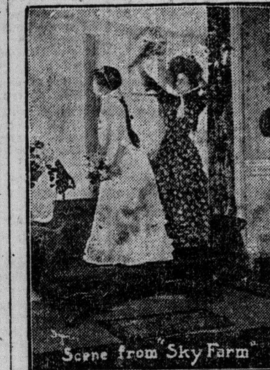
Scene from Sky Farm

"Sky Farm," which is announced for production at the Grand next week, is the most noted big rural production of the season. The piece is in the "Old Homestead" description, but the staging illustrates American life in the country with more fidelity than "Old Homestead" does, and at the same time refrains from exaggerating the comedy of the story. The piece filled the theatre in Boston for nearly four consecutive months last winter, and after a brief intermediate season of a few one night stands was located for the rest of the season in New York, where it ran for over 100 nights. The action of "Sky Farm" principally treats of the tribulations and ultimate joy of several pairs of lovers, and the comedy