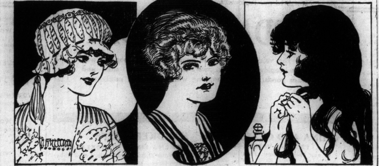
Hide Curlers Under Cap.

By LUCREZI BORIA Prima Donna of the Metropolitan Opera Company, New York.