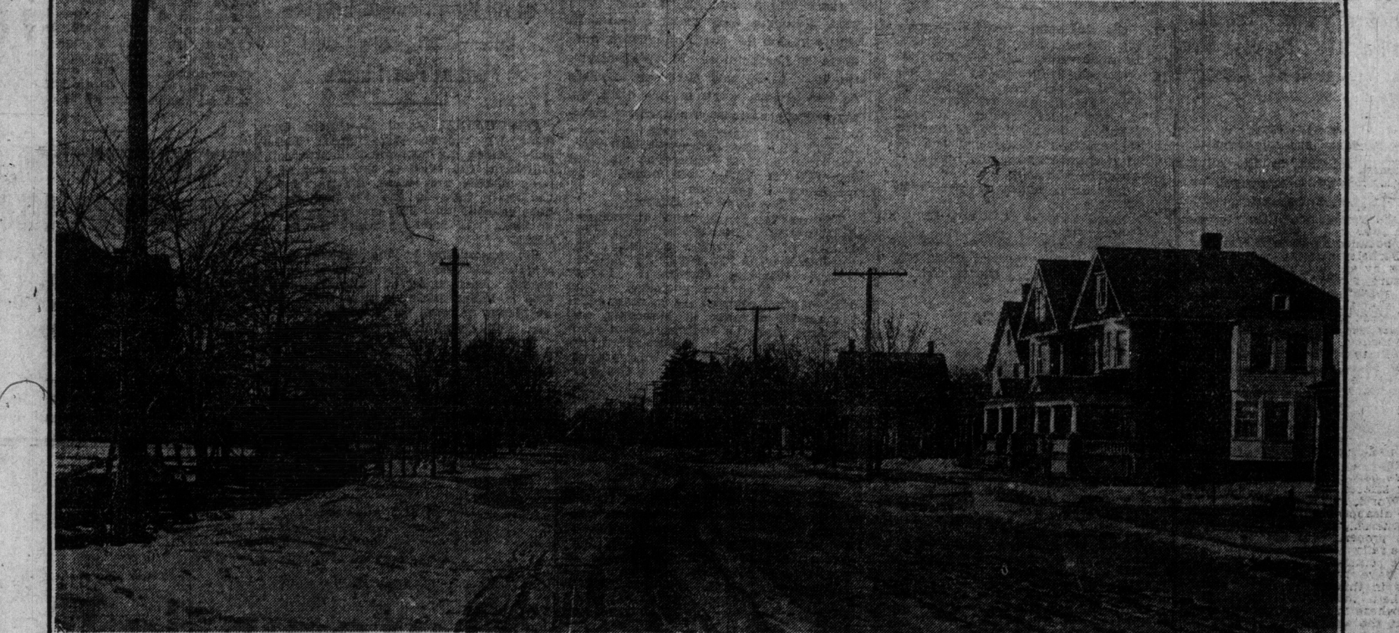
Rosedale butts right up against the houses shown at the right in the above photograph. The house of which the steps and part of the porch are seen is on the property.

Are You Interested in Welland? Rosedale Lots Are The Best Buy