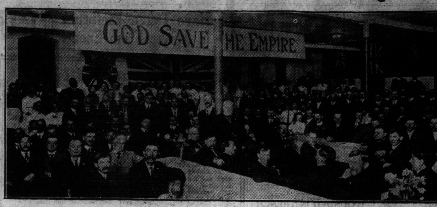
Flashlight photo of big gathering in Earlscourt Central Methodist Church Hall last night, under the auspices of Ward Six Conservatives.