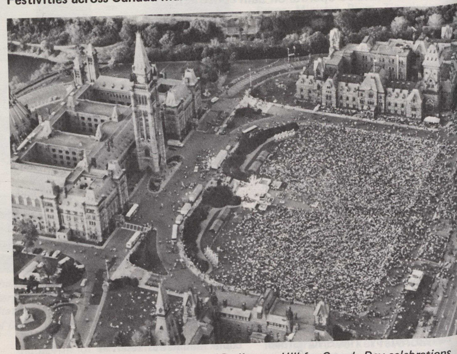
Thousands gather on the front lawn of Parliament Hill for Canada Day celebrations.

Festivities across Canada mark one-hundred-and-fifteen years of nationhood