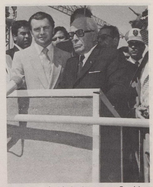
Mr. Joyal (left) looks on as President Habib Bourguiba officially inaugurates the dam at Sidi Saad on Oued Zeroud.

The 60-metre wide concrete chute of the spillway ends in a ski-jump structure that discharges into a concrete lined stilling basin 121 metres long and 60 metres wide. Dissipation of the water pressure is completed in a second basin 126 metres wide. The structure is designed to handle a flood of a magnitude likely to occur only once in 10 000 years.