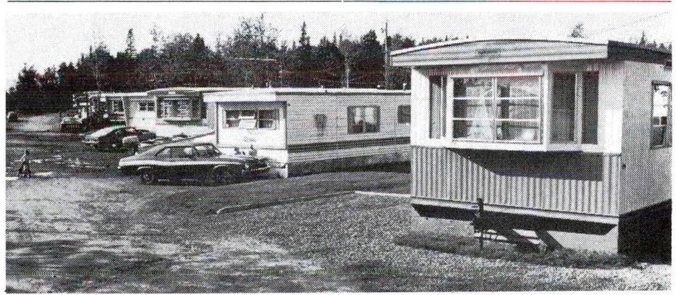
All the comforts of a home away from home.

Car ton bras sait porter l'épée, Il sait porter la croix! Ton histoire est une épopée Des plus brillants exploits. Et ta valeur, de foi trempée, Protégera nos foyers et nos droits. Protégera nos foyers et nos droits.