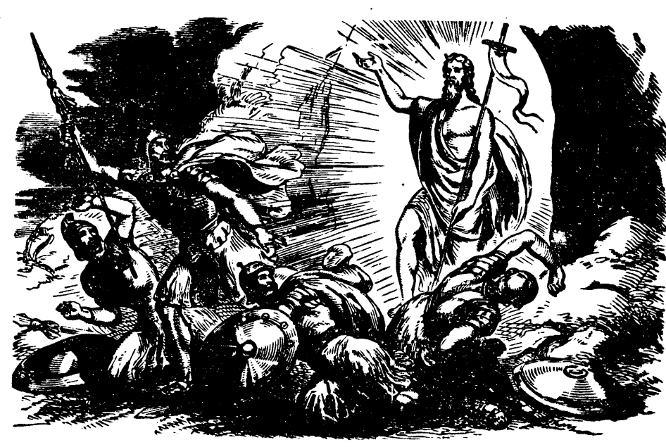
THE WATCH AT THE SEPULCHRE.

And many people think they can see this further in it too: "Give us" implies more than one praying and "this day" implies meeting together daily to pray; and where could the coming together to pray and the praying thus every day be so perfectly seen as in family prayer? But no one prays this