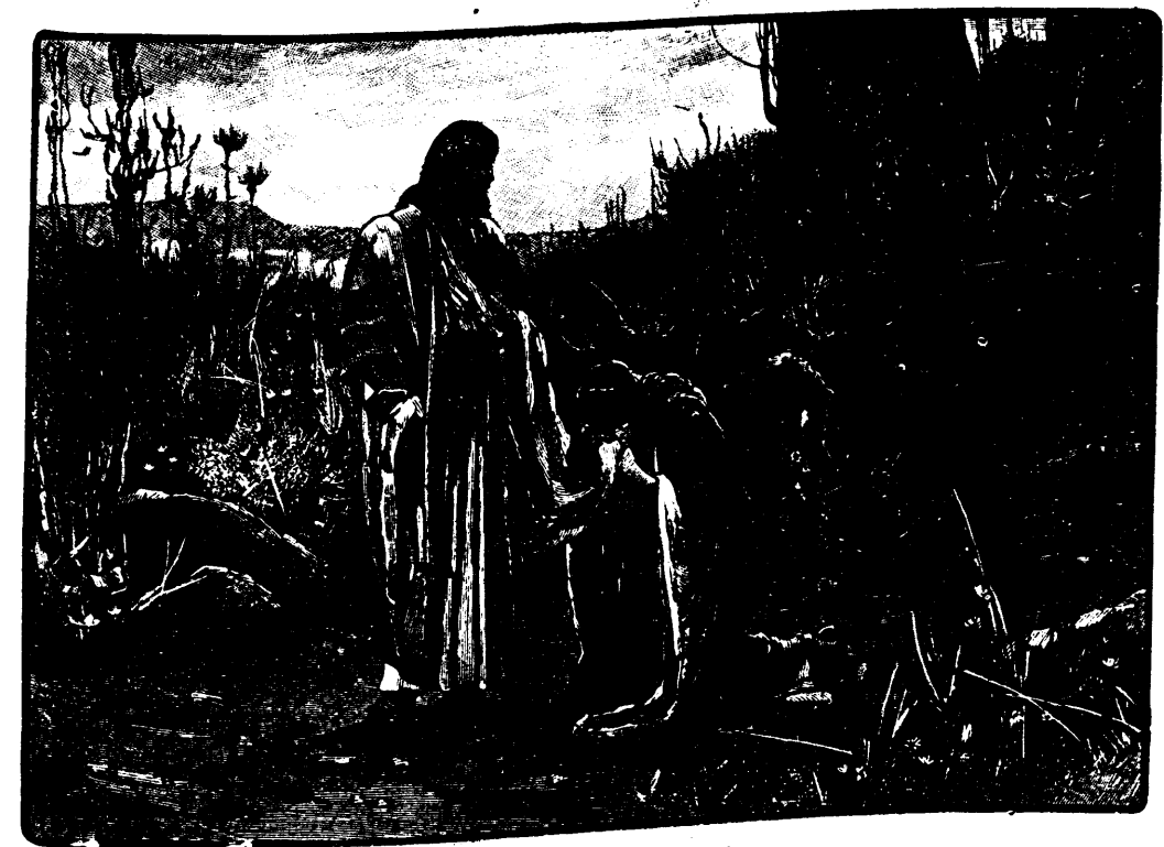
THE FIRST EASTER.