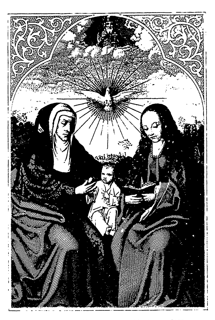
SAINT ANN AND THE BLESSED VIRGIN.