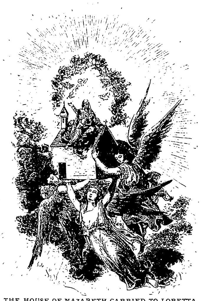
THE HOUSE OF NAZARETH CARRIED TO LORETTA BY ANGELS.