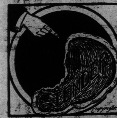
IT'S A TENDER POINT