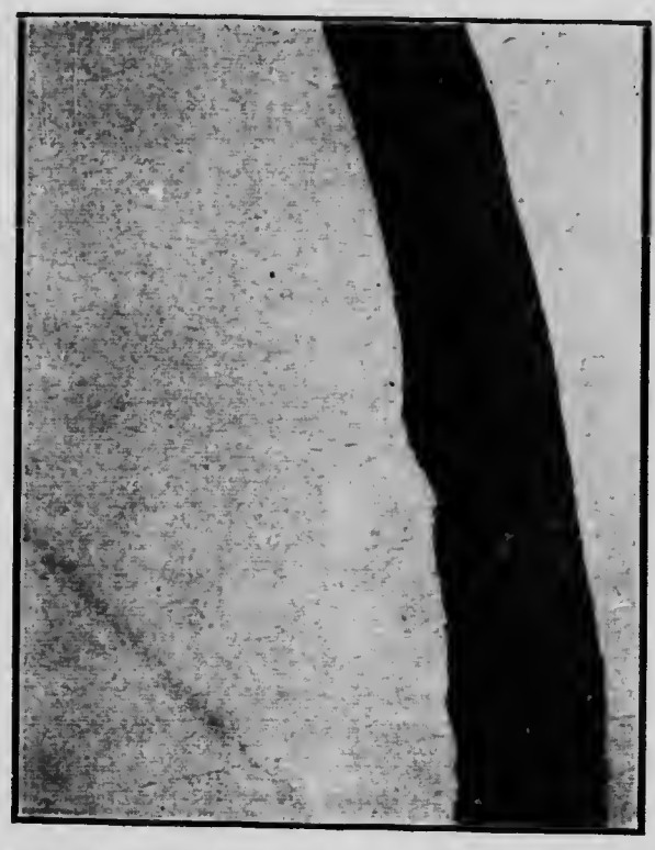
Twig infested by oyster-shell scale. (Author's illustration.)

THE oyster-shell scale is a familiar object to fruit-growers. It occurs commonly in the Lower Kootenays, in the Lower Fraser Valley, and in the developed sections of Vancouver Island. It is