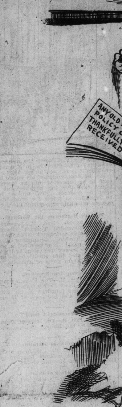
MR. O'HARDY: Sure, an' it isn't knockin' at the door as Charly? I'd be this blissed Noo Year's mornin' as we could man, Oliver, hadn't lift me wid a hipless fam'ly av little ones on me hands.