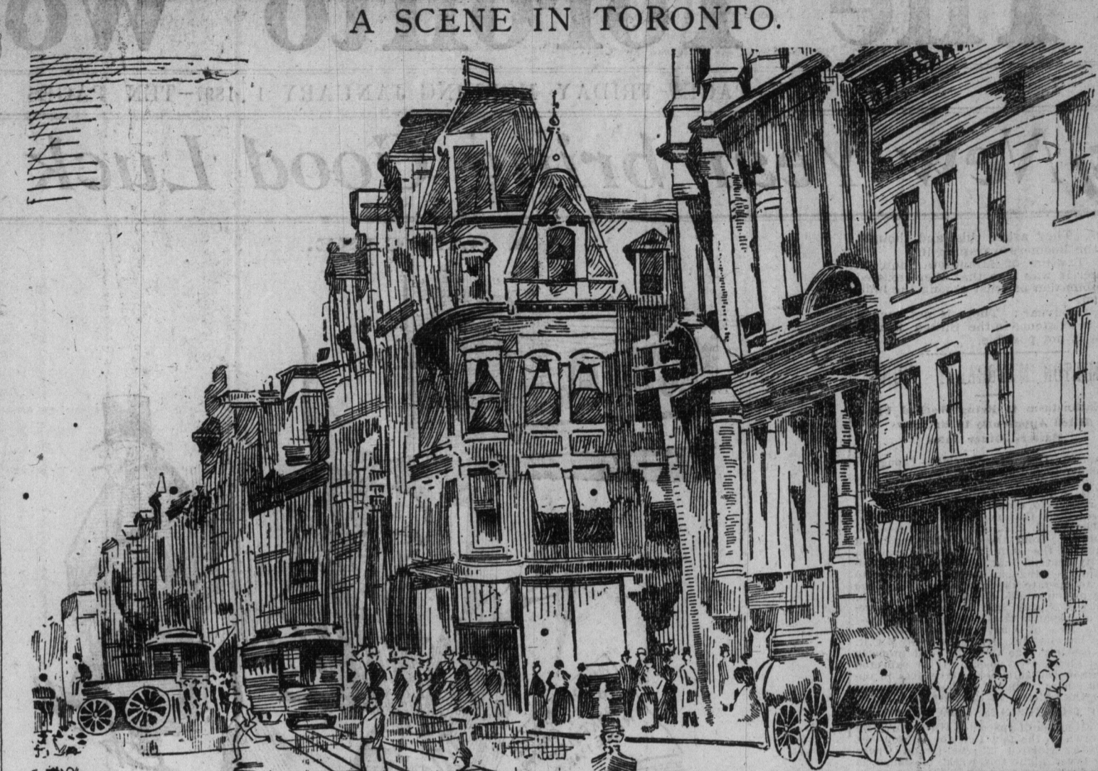
A SCENE IN TORONTO.

Sherwood Lodge, S.O.E. No. 70. Sherwood Lodge, S.O.E. No. 70, held its annual dinner, 70 strong, at the Davison Hotel last evening.