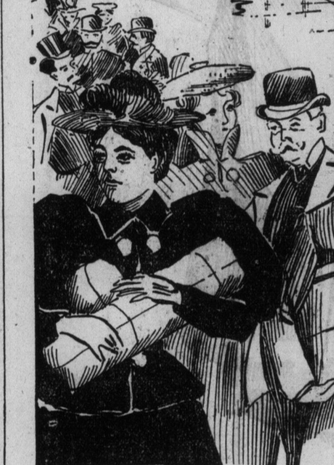
TORONTO'S BUSIEST CORNER.