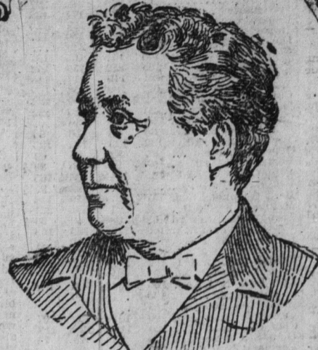
Oronhyatekha, M.D., Supreme Chief Ranger.