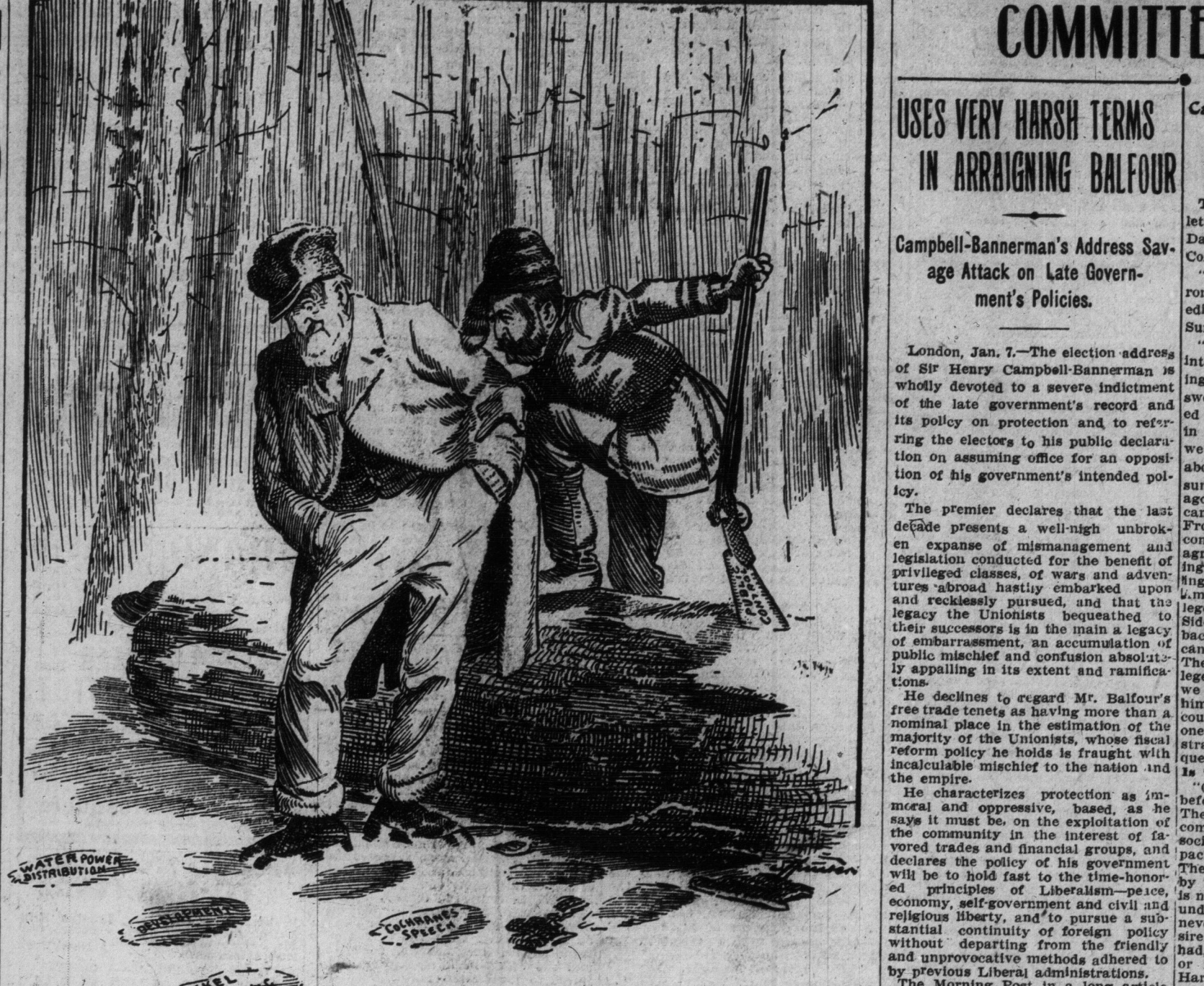
GUIDE WHITNEY (to Old Man of Ontario): Don't you think it's worth following up?