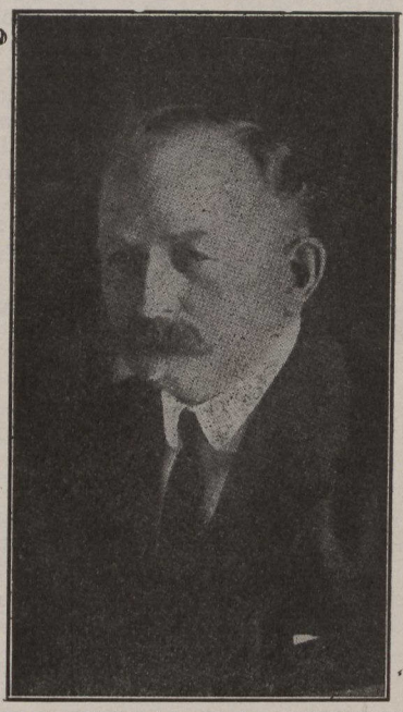
SIR THOMAS SHAUCHNESSY,

Much speculation has been indulged in as to where the stock of the Canadian Pacific Railway is at present held. Sir Thomas Shaughnessy this week informed The Monetary Times that the total number of Canadian Pacific common stock shareholders at the present time is about 27,000, the number of Canadian holders being 3,400. Of the common stock, holders in Great Britain have approximateby 60 per cent. About 15 per cent. is held in Germany and France; 23 per cent. is divided about equally between Canada and the United States; the remaining 2 per cent. being scattered in the colonies and other countries. Nearly all the 4 per cent. consolidated debenture steek and the 4 per cent. dated debenture stock and the a per cent. preference stock is still held in Great Britain.