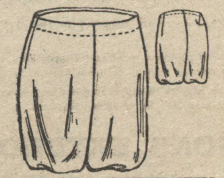
NO. 5373-BOYS' KNICKERBOCKERS.

Where more than one pattern is wanted, additional coupons may be readily made after the model below on a separate slip of paper, and attached to the proper illustration.