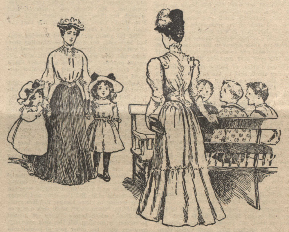
THE MINISTER'S WIFE CAME IN, BRINGING HER TWO LITTLE CHILDREN WITH HER.

And so at last she came to the place which she had had in her mind, a beautiful bit of green sward at the edge of a stretch of woods, known as the 'Great Pines,' and, spreading her shawl on the ground, sank down upon it with a long-drawn sigh of contentment and delight. To the right, out of sight behind intervening rocks, was the hotel with all its