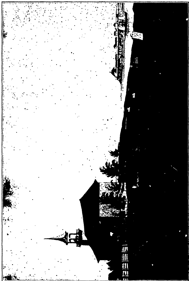
WATER COLOR OF ST. MARK'S IN 1834, BY D'ALMAINE.