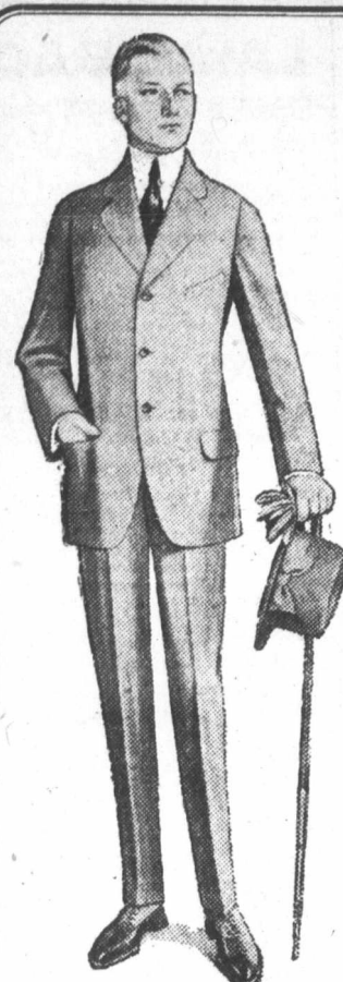
Copyright, Canada, 1916.