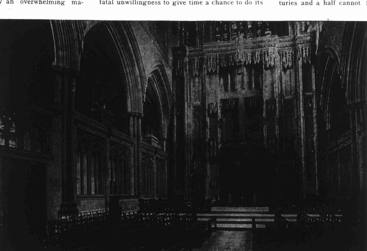
Winchester Cathedral, the Reredos.

be settled on their own merits. And lo and behold well-meaning people in increasing numbers are proposing that we shall repeat the mistakes of the "Middle Ages" and the sixteenth and seventeenth centuries and begin anew the manufacture of Creeds and Confessions. It is the old story of the philanthropist in a hurry with his fatal unwillingness to give time a chance to do its