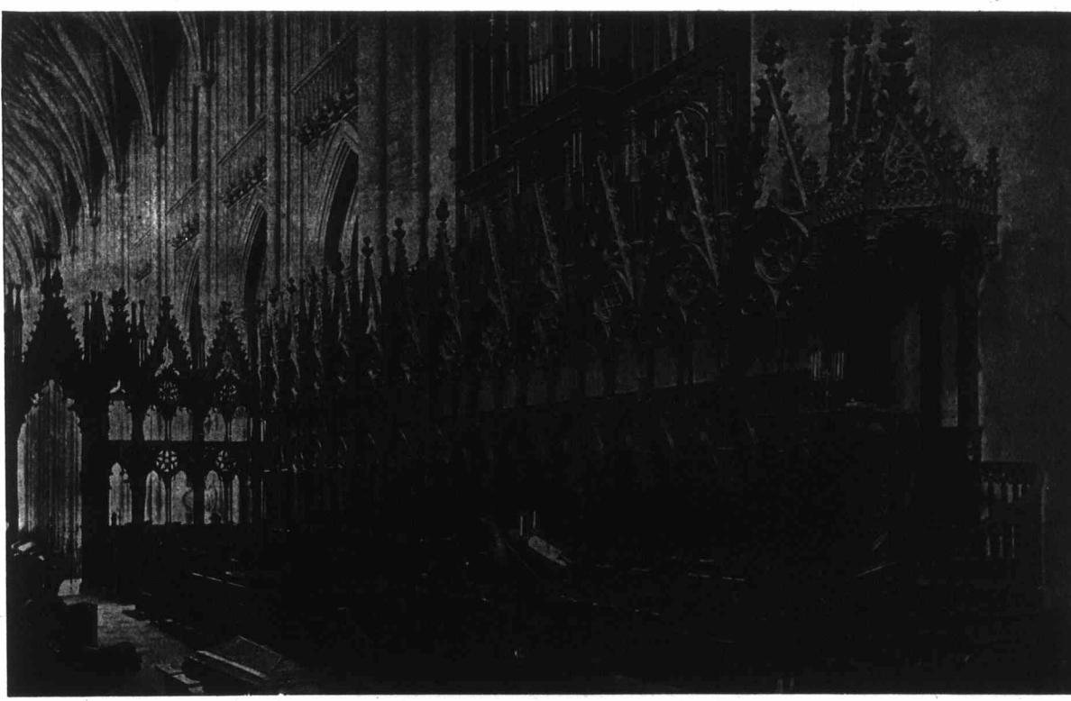
Winchester Cathedral, Choir Stalls.

Our correspondent, Spectator, has, we think it will be very generally conceded, fully established