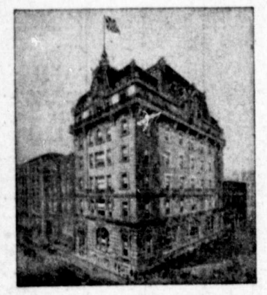
COMPANY'S BUILDING, MONTREAL.