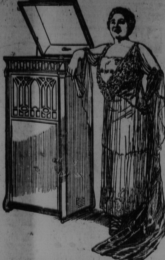
Alice Verlet Drawn from actual photograph