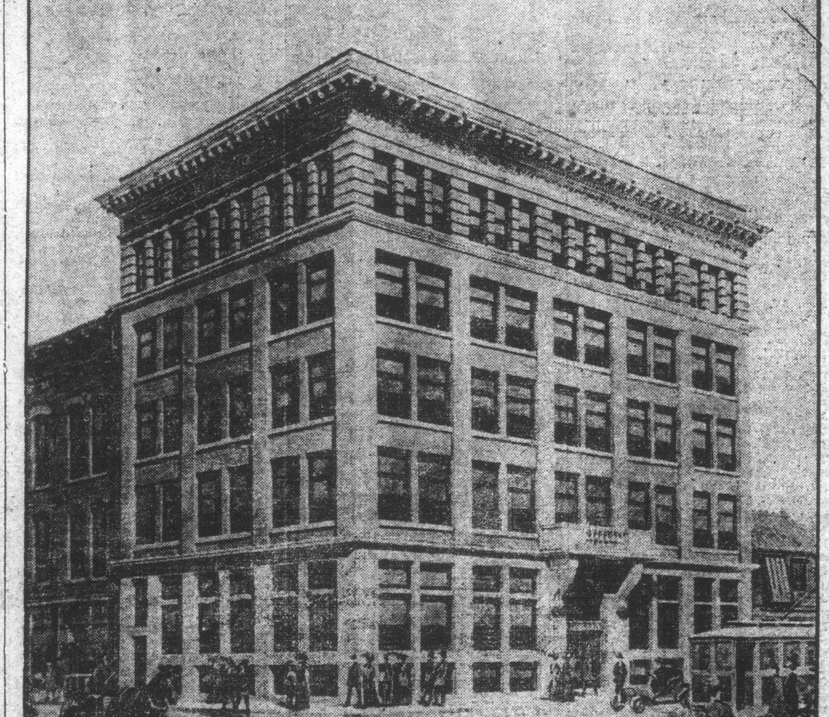
THE TIMES NEW BUILDING

Contracts were signed Friday for the rection of a fine new nome for the laws a spacious basem it. The construction will be of reinforced concrete, faced with press it brick, the lower stories being faced with sand-stories and granite. The first and second floors will be devoted to office purposes, being built en suite, and fitted up in most modern fashion. The third floor will be used as