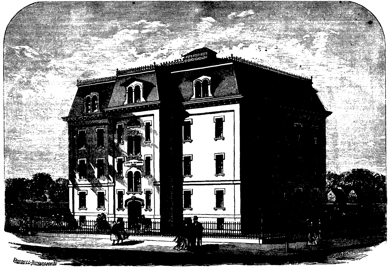
LEWIS GRAMMAR SCHOOL-HOUSE, BOSTON, MASS.

The building is well proportioned, and the pressed brick with which the four walls are faced, and the white granite trimmings, produce a pleasing contrast.