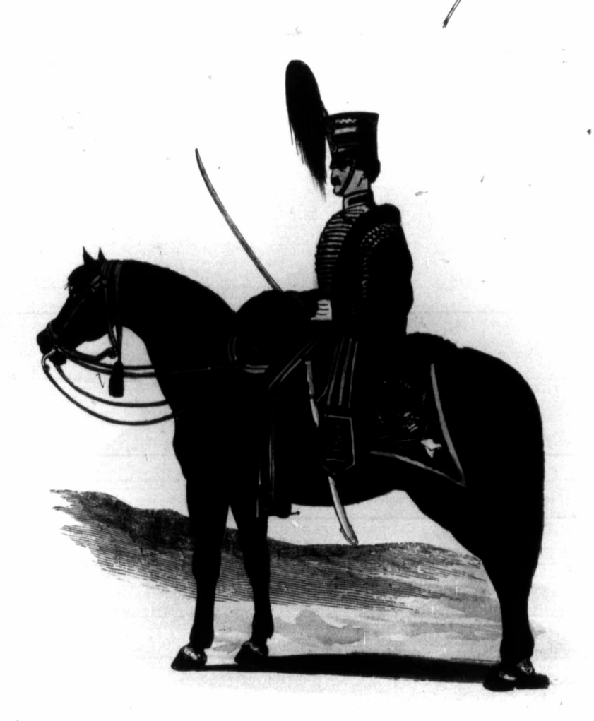
FIFTEENTH (THE KING'S) HUSSARS.

The rages spanied service power the filight-service Light, limited quity. sword, in who sical pactivite the hilightness might vered.