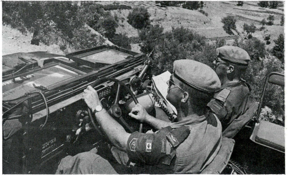
Two members of the Canadian Airborne Regiment of Edmonton, Alberta, on a reconnaissance patrol, pass the old village of Maxaipas in the mountains near Nicosia. The regiment formed the Canadian peacekeeping contingent of the United Nations Force in Cyprus up

This year, more Canadians will be in better physical condition than on any previous birthday they have celebrated. In the 1960s and 1970s, led by two prime ministers who extolled the virtues and pleasures of physical fitness, and a jogging Governor General, more and more middle-aged Canadians turned to exercise and sports to firm-up sagging muscles and enjoy a revival of the