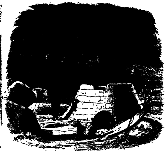
In the west