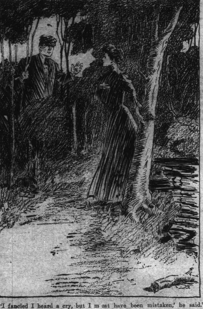
"I fancy I heard a cry, but I must have been mistaken," he said.