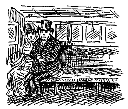
CONTINUED DITTO ON ARRIVING AT BLOOR STREET.