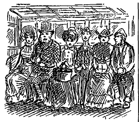
CROWDED STATE OF THE CAR AS IT LEFT THE CORNER OF KING STREET.