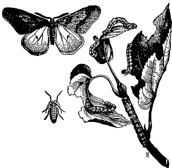
Fig. 24, after Comstock.

The larva of this insect is a yellowish looper or measuring worm with a reddish head and ten wavy black lines along the back. It is shown in