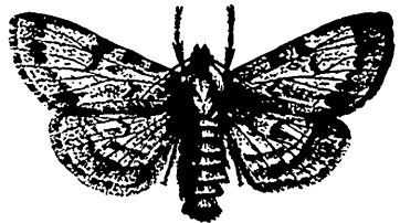
Fig. 23, after Riley.