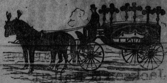
(Cut of our new Hearses.)