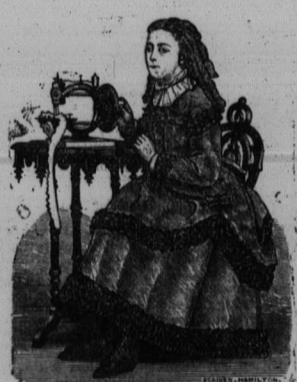
THE LITTLE WANZER.