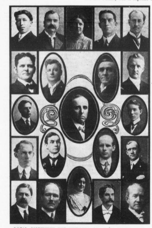
LOCAL COMMITTEE FOR EPWORTH LEAGUE'S CONVENTION.

vice. (c) There is unity in worship. One God and Father, who is supreme over all,