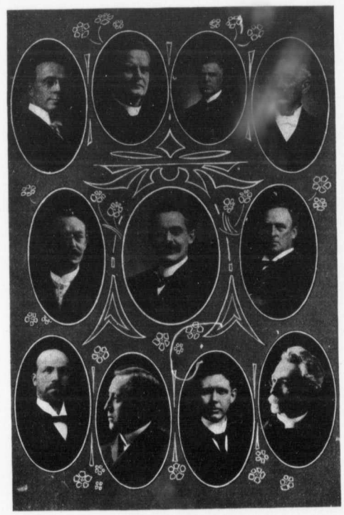
CANADIAN EPWORTH LEAGUE.

Ethnology regards the boy as a rational animal, as a social creature, and is concerned with his intellectual and religious development. We must not ignore the fact that a boy has a body; that he wriggles, squirms, giggles, shouts, jumps, runs, climbs, falls, and gets hungry. That is