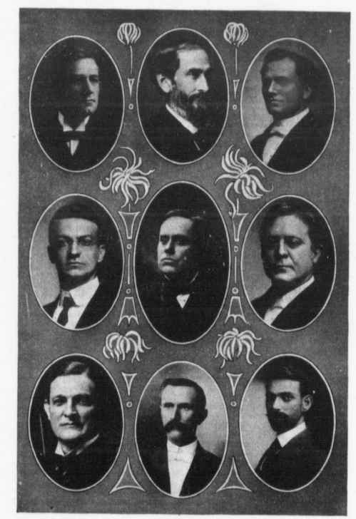
METHODIST EPISCOPAL CHURCH SOUTH.

be ashamed of this ancestral blood. His American citizenship is his passport to nobility of rank and charactor whatever peasant strain he brought with him from the Old World. "It is not in our stars but in ourselves that we are underlings." The records of the White House tell us that tailors and canal-boat drivers and rail-splitters have not made bad presidents when they have been trained in poverty to industry and integrity and charity before the cares of state rested all too heavy upon them and drove them to commune with God.