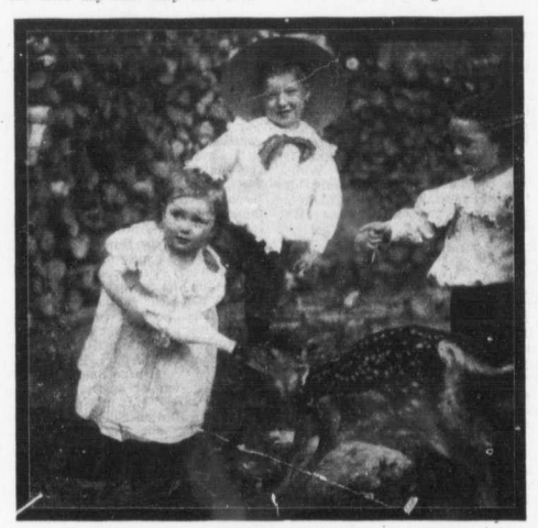
HOW THEY FED THE DEER BABY