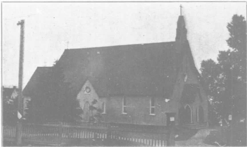
THE OLD WOODEN CHURCH