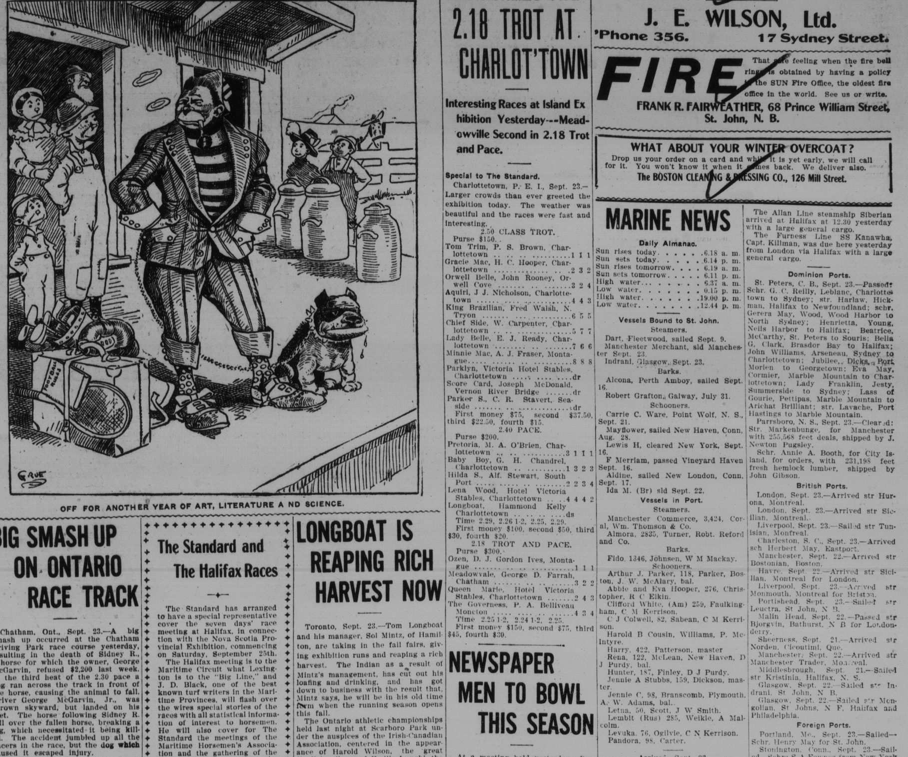
OFF FOR ANOTHER YEAR OF ART, LITERATURE A ND SCIENCE.